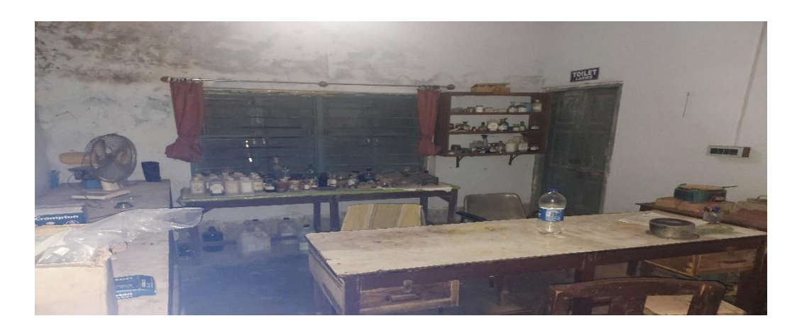
Chemical Preparation Room

B. A., B. Sc.& B. Com. (Hons. & General)& M. Sc. in Zoology