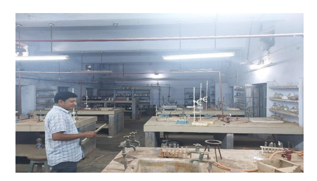
Chemistry Lab -2