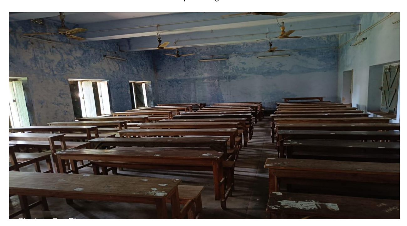
Class Room 1