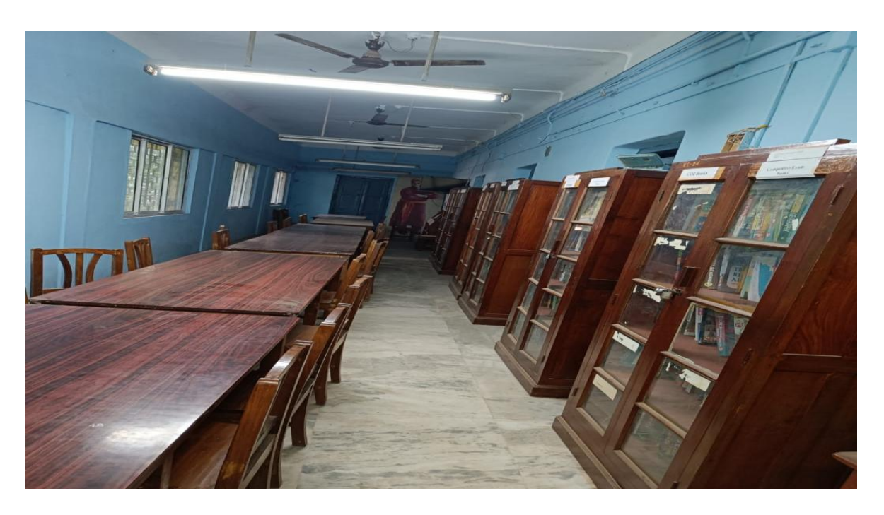
Library Reading room 2

B. A., B. Sc.& B. Com. (Hons. & General)& M. Sc. in Zoology