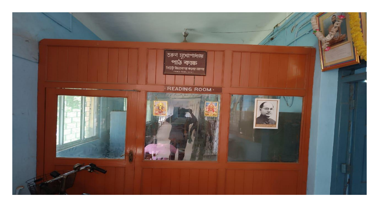
Library Reading room 1