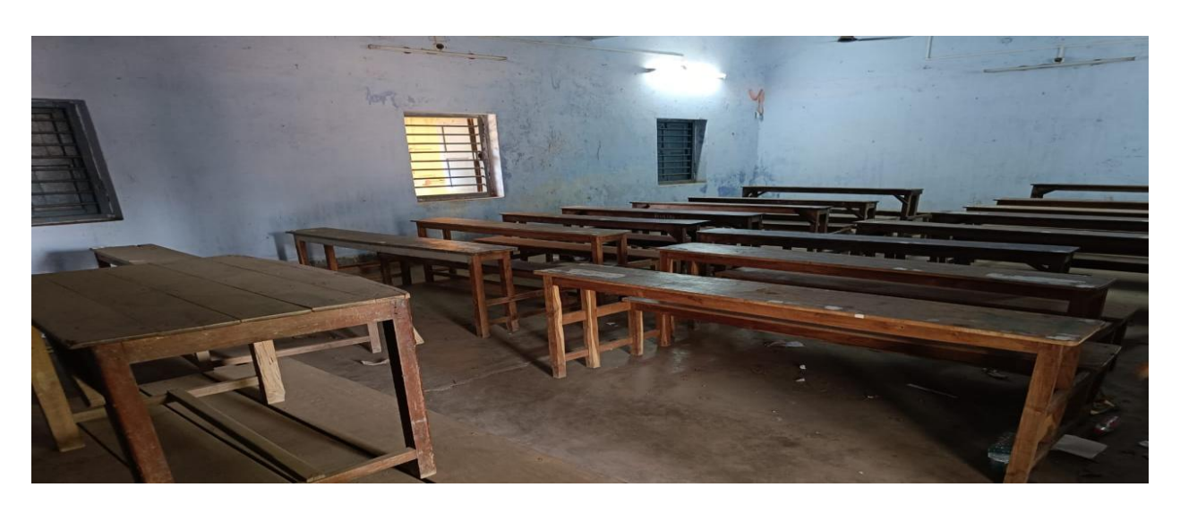
Class Room 2

B. A., B. Sc.& B. Com. (Hons. & General)& M. Sc. in Zoology