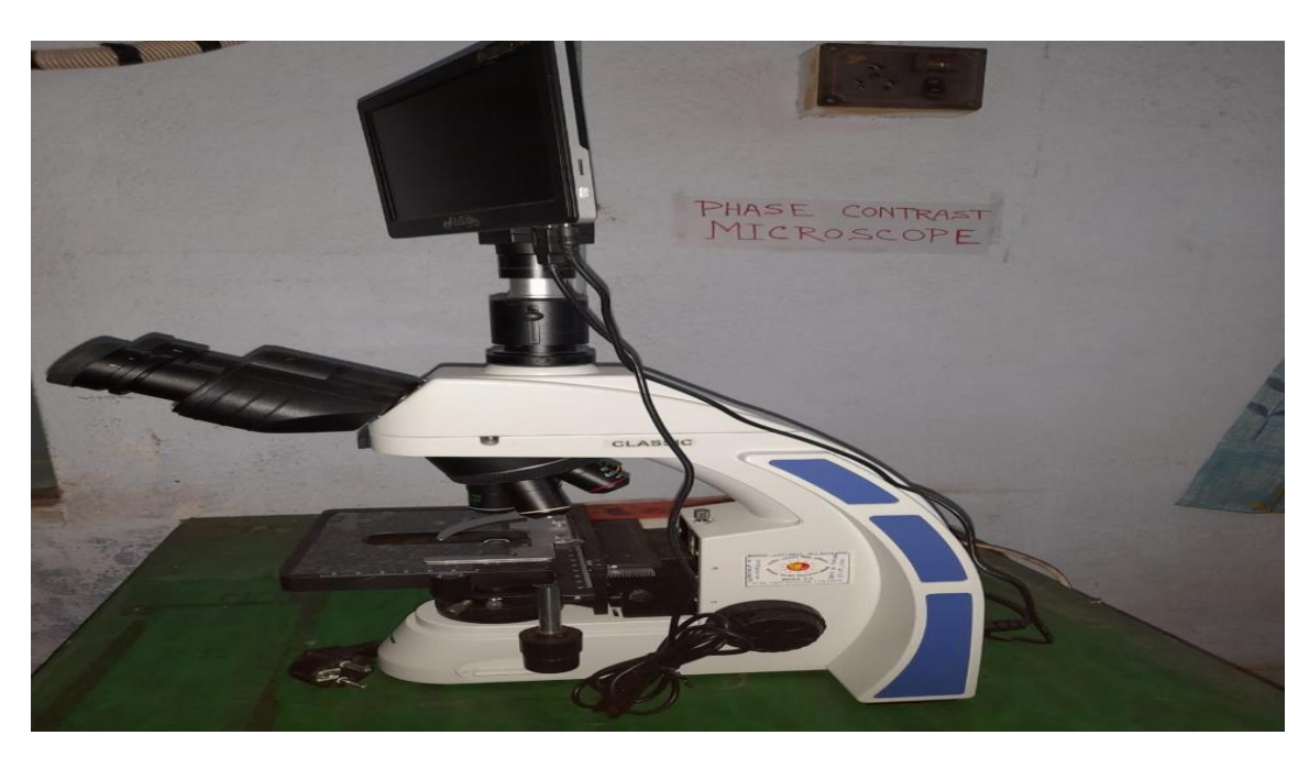
Phase Contrast microscope