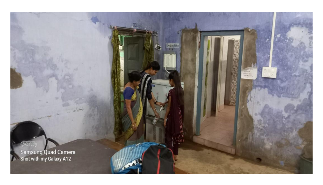
Drinking water picture 1

B. A., B. Sc. & B. Com. (Hons. & General) & M. Sc. in Zoology