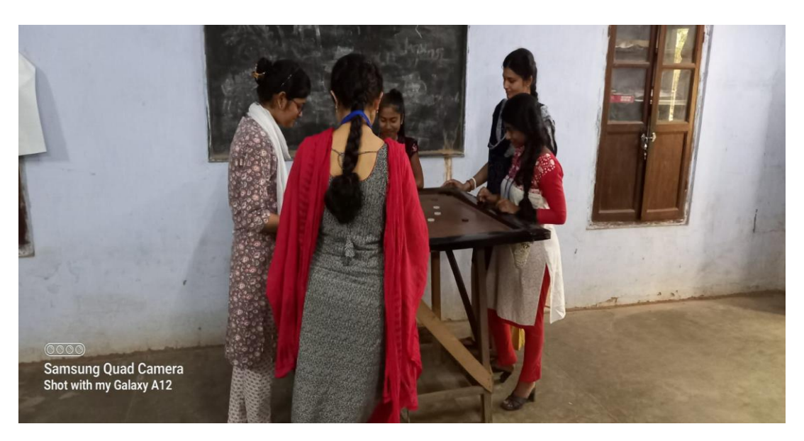
Girls' Common Room Picture 2