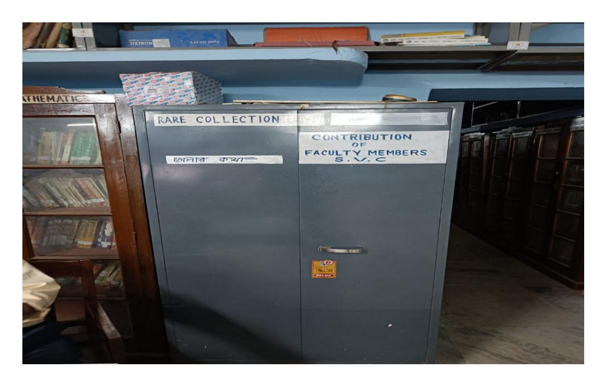
Rare collection 1

B. A., B. Sc.& B. Com. (Hons. & General)& M. Sc. in Zoology